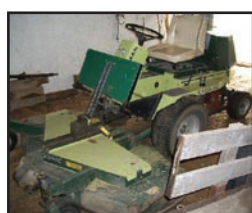
Cushman "Front line" 23hp Wisconsin water cooled, industrial quality 72" riding mower.

Kennedy lockable Machinist tool box, large asst Machinist/ Millwright tools - calipers, dial indicators, micrometers, bevel gauges, etc, Number of high quality hand tools electric and otherwise, wrenches, sockets, drills, cutoff saw, die grinders, Large wooden gang boxes, 1-1/2 ton coffin hoist, come along, handi man jack, 120v spotlight floor lamp, Deluxe Dremel set, car ramps, Sears air compressor, 6" bench grinder, cement finish tools, hydraulic cylinders, etc If your looking for it, we've probably got it. 2400psi pressure washer, stainless counter tops, Heavy duty 21 drawer parts bin. Steel upright "paint" cabinet, asst heavy vinyl tarps, several Batt chgrs