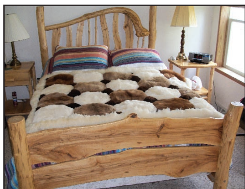
Beautiful natural Maple log full size bed, made by "Duane Shoup" part of a 3 piece set