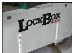
Lockable "Delta" steel gang box