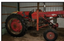
Massey 165 gas 2127 hrs on meter, pto dr hydro pump. 3 Pt 13.6-38 rears, bring your wrenches, we may sell loader separately. Chains available