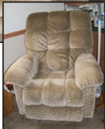
Lazy Boy Rocker recliner