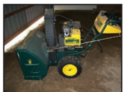
Yard Master 12hp 30" snow blower

Heavy duty 8' blade 3pt mount, 7' snow blade, Snowmobile trailer canopy, Otter sled, 2-wheel utility trailer, calf puller, dehorning equip, banders, elec fencing equip, 18 1/2" Vibra shank cultivator, spare parts available, and harrow sections, Cast iron varigated land roller "packer", 3 pt bale fork,