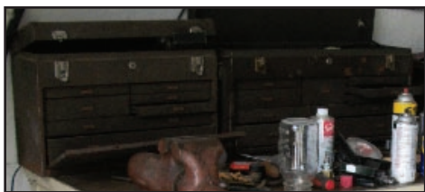
rolling shop table w/ Wilton shop vice