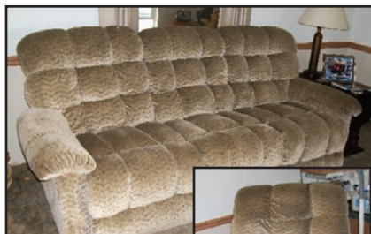
Lazy Boy Couch w/recliners on each end