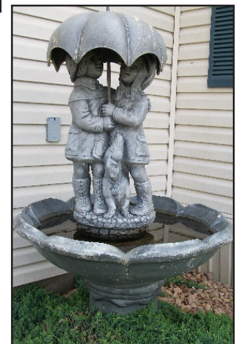
Full size yard fountain

Antique hand adze, asst early chairs, broad axe head, hump back trunks, old RR chair from pass. Train, rare old lamp, post wrapped in an old printing press sheet., heavy duty old kerosene lantern, bob sled hdwe, 1933 and '35 MN license plates.