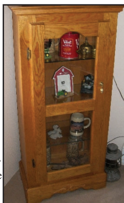
Glass front Oak "Curio" cabinet

Lazy Boy glider rocker, End table w/leather inlay top, blonde drop leaf table, bookcase, dehydrator, Heavy drop leaf end table, High quality KLH speakers, Sharp carousel microwave, Very entertaining "Bear" lamp, Ashley office chair, Oreck XL upright vacuum, high quality "fleece" comforter.