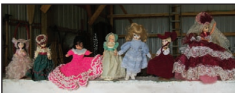
Selection of collectible dolls

100 year old Billiard table "Magazine cushion" Schaaaf Mfg was removed from a bar in Nebraska back in '43. Has been meticulously restored but still retains history, character, and class. An absolute top rated collectible and a real show piece for a "Deluxe" home. Currently disassembled for transport.