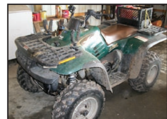
2001 Polaris Explorer 400 4wd complete sprayer outfit available, tank, boom, etc.