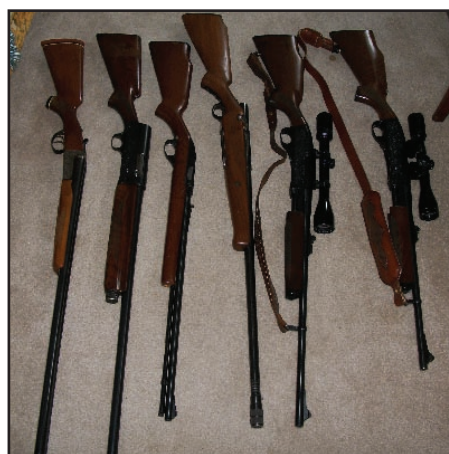
Rem mod 11, 12 ga 2 3/4", Glenfield .22 semi auto, Rem 7600 BDL grade engraved pump action 30-06 "carbine" w/ scope, Rem 7600 BDL grade engraved 30-06 pump w/ scope full length rifle, Mossberg 12 ga bolt action, Spanish "Mercury Magnum" side by side 12ga 3" M/F, ammo and access.